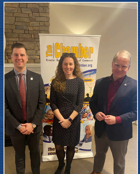
Presented an update on the state budget and Harrisburg happenings to business and community leaders at a recent Greater Hazleton Chamber of Commerce breakfast.