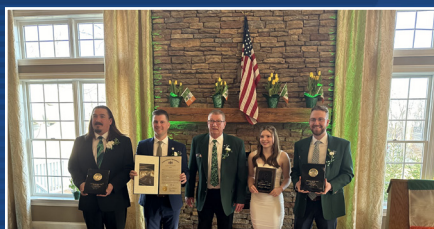
Spoke at the Freeland Sons of Erin banquet while honoring its citizen of the year and other award winners.