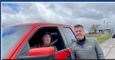
Hosted my first Shredding and Cleanup Day at the Luzerne County Fairgrounds in Dallas. About 200 vehicles passed through to take advantage of free paper shredding and tire disposal.