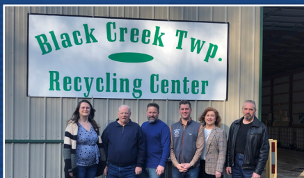
Helped Black Creek Township supervisors reopen their recycling center in mid-March. Residents from surrounding areas can also drop off aluminum cans and cardboard here.