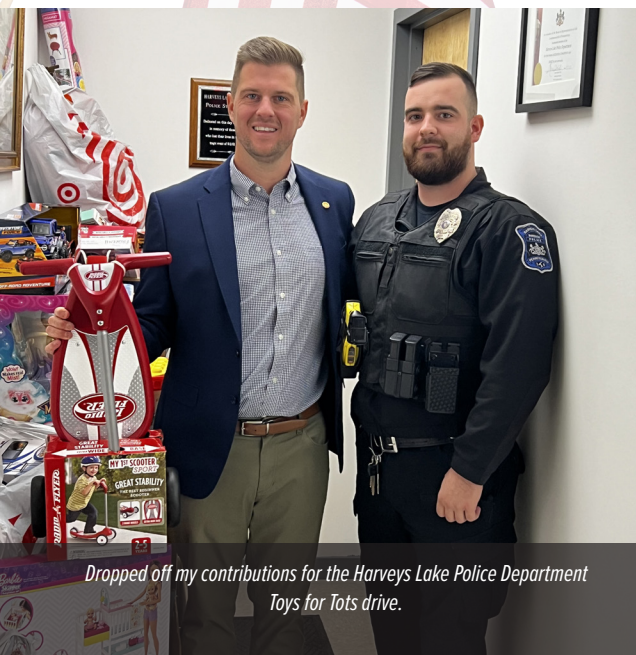
Dropped off my contributions for the Harveys Lake Police Department Toys for Tots drive.