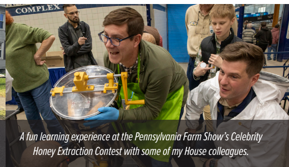
A fun learning experience at the Pennsylvania Farm Show's Celebrity Honey Extraction Contest with some of my House colleagues.