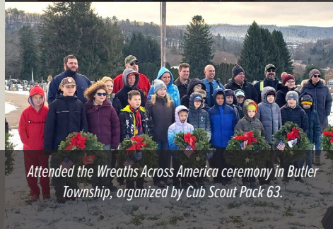
Attended the Wreaths Across America ceremony in Butler Township, organized by Cub Scout Pack 63.