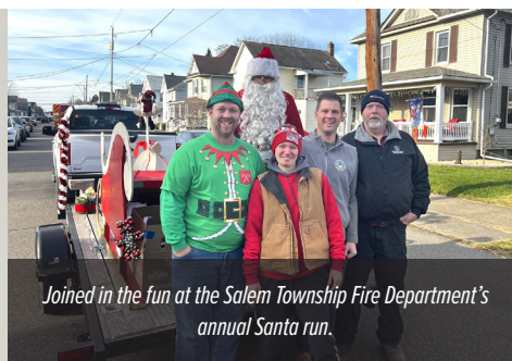
Joined in the fun at the Salem Township Fire Department's annual Santa run.